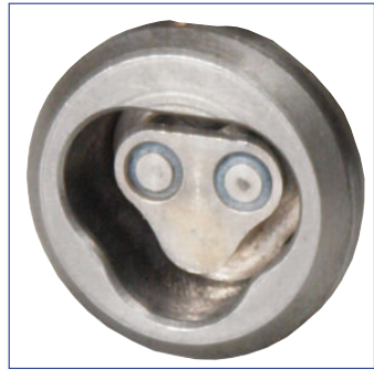
Figure 1 - Dirty Lock Face

If these procedures fail to provide satisfactory results, please contact CyberLock Technical Support.